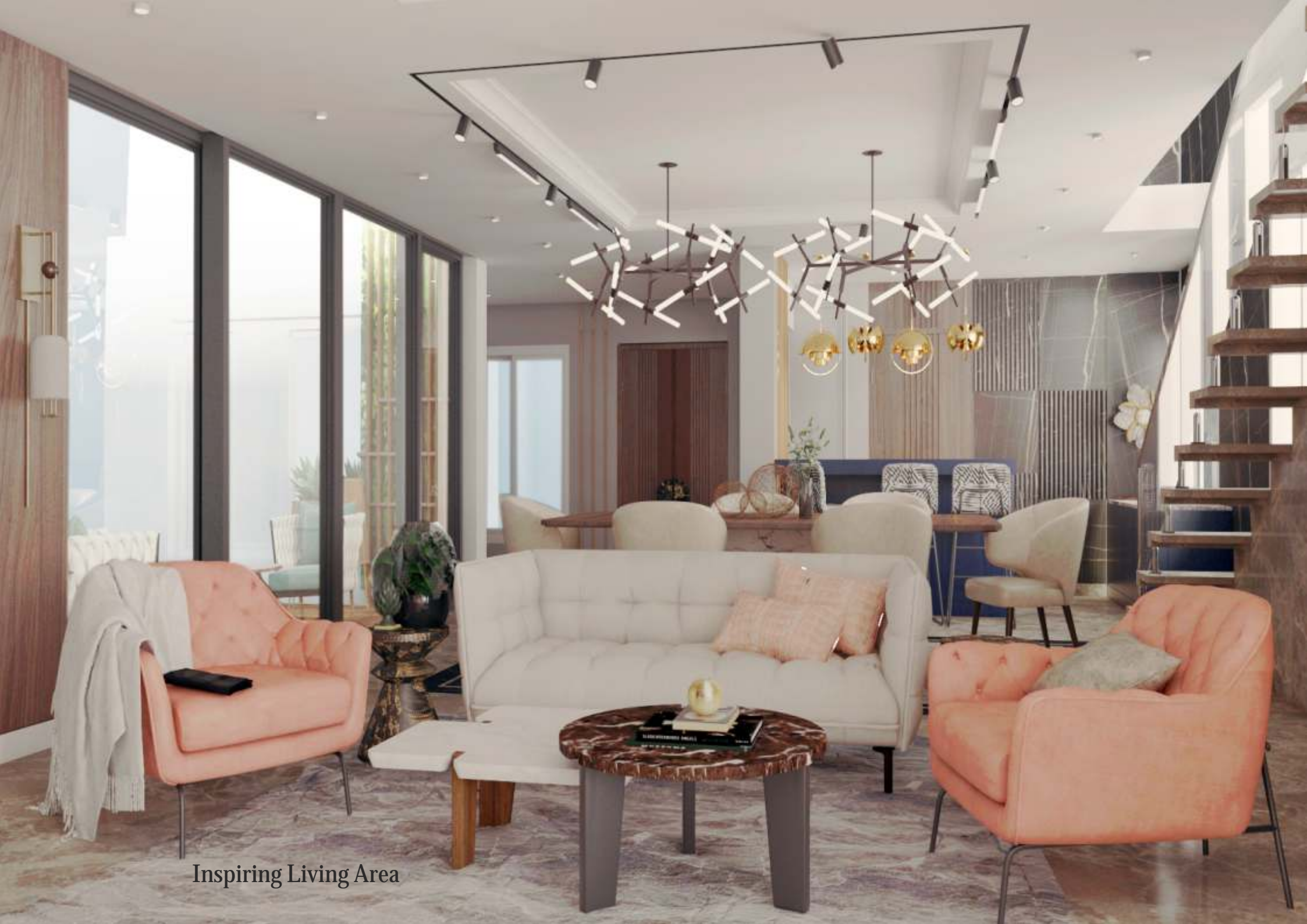
Inspiring Living Area