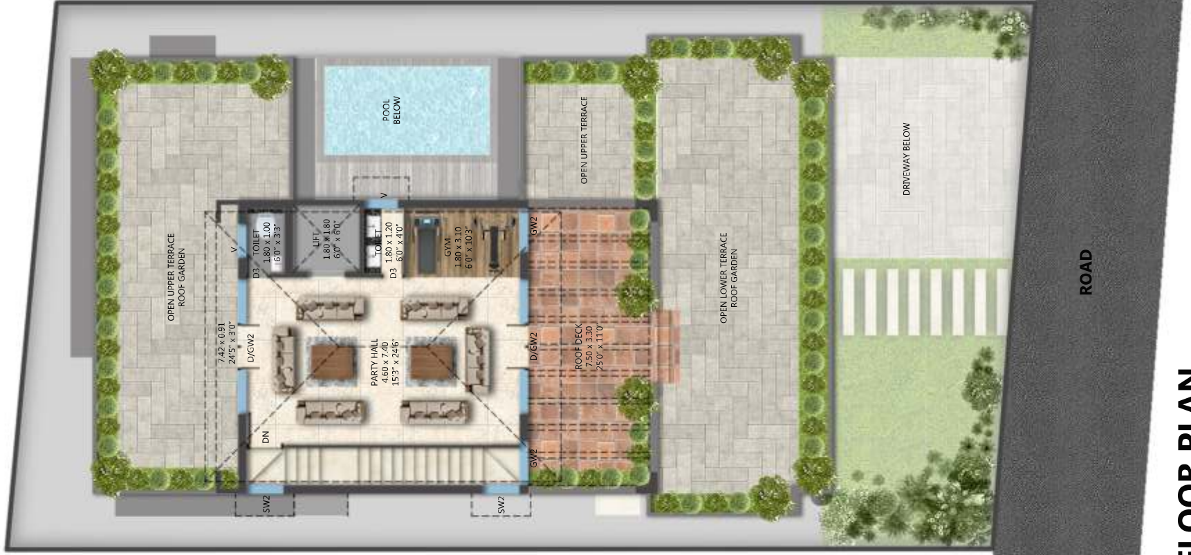
SECOND FLOOR PLAN Second Floor Area = 1055.00 sqft Total Area = 5035.00 sqft