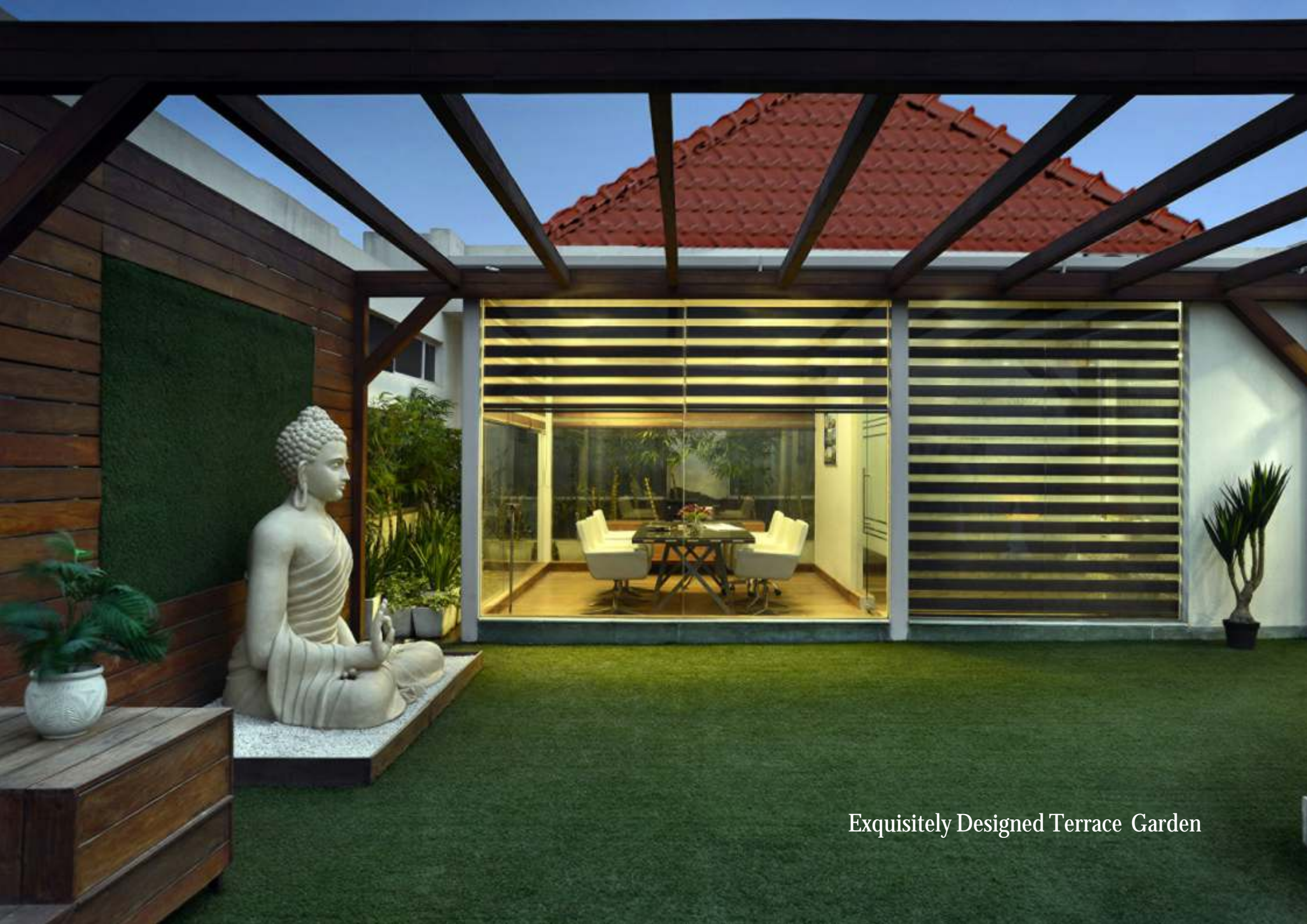
Exquisitely Designed Terrace Garden